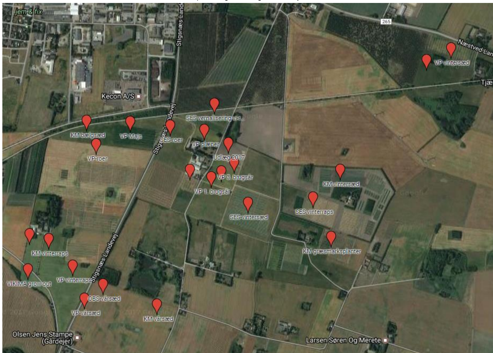
2017 placering af forsøgene ved Tystofte